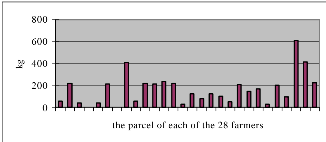
Figure 3.1. : The banana harvest of 1998 (in kg per plot)